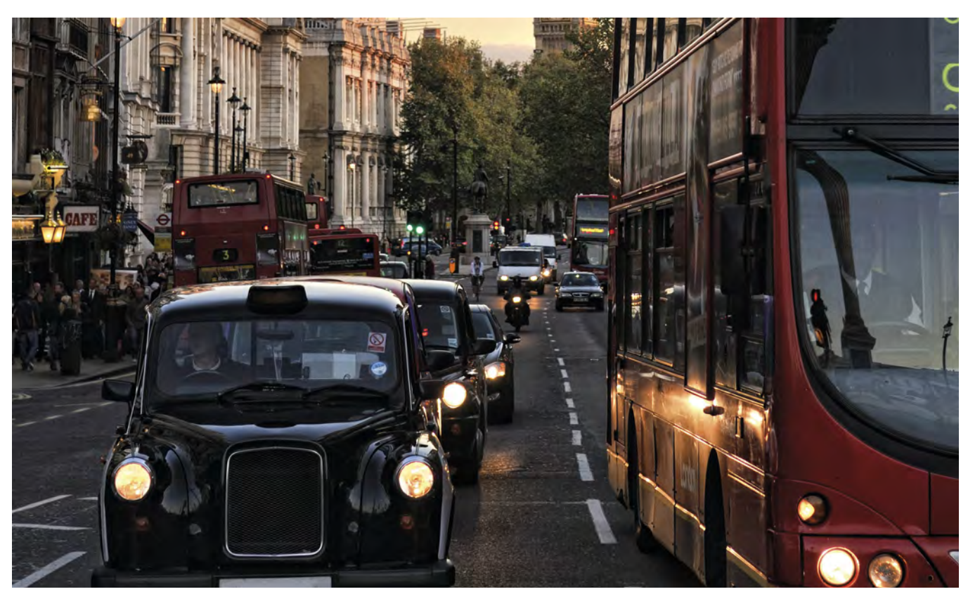
London bus and taxi.