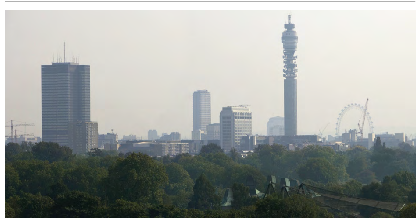
London air pollution.