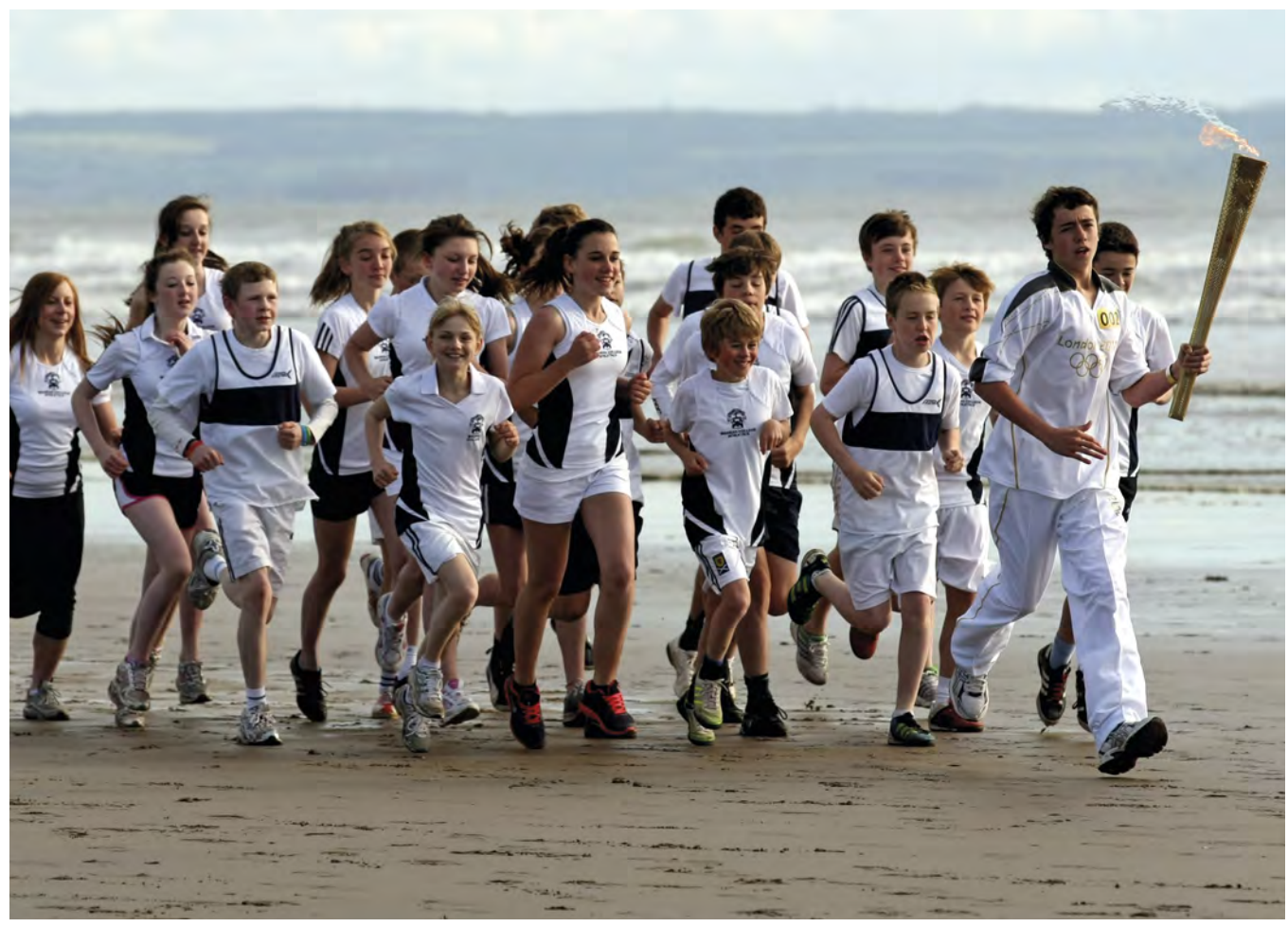
The Olympic Flame is carried on West Sands beach.

7.59 The Commission has contributed its own piece of learning legacy targeted towards the secondary school curriculum<sup>22</sup>. A series of video thinkpieces featuring members of the Commission and London young people pose questions, give views and provide some background on major legacy topics.