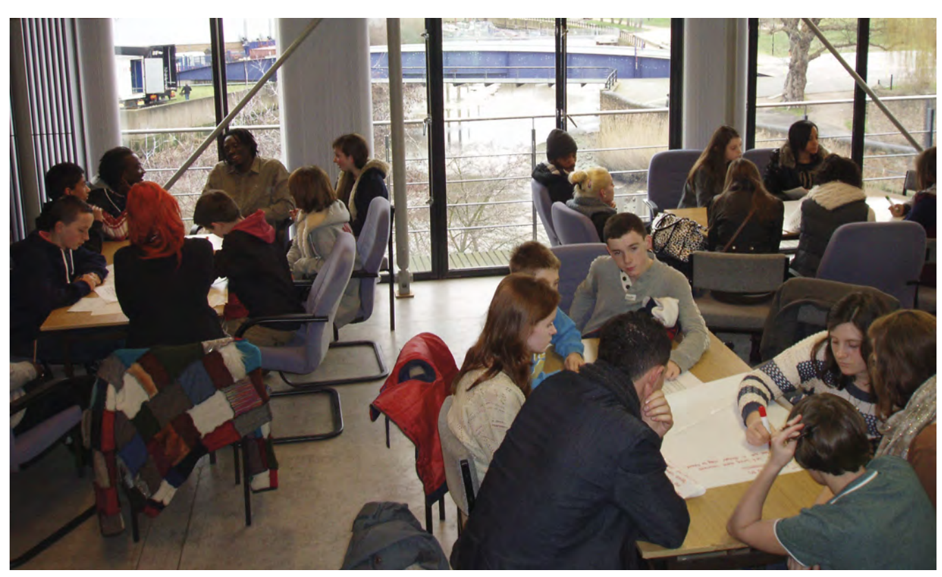
Leaving legacy for London's young people.