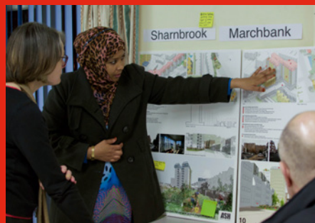
Residents on the West Kensington and Gibbs Green estates putting together plans.

Both Ken Livingstone and Boris Johnson promised to provide land for a Community Land Trust. But both dodged this commitment, preferring to sell land to the highest bidder. That usually meant big developers.