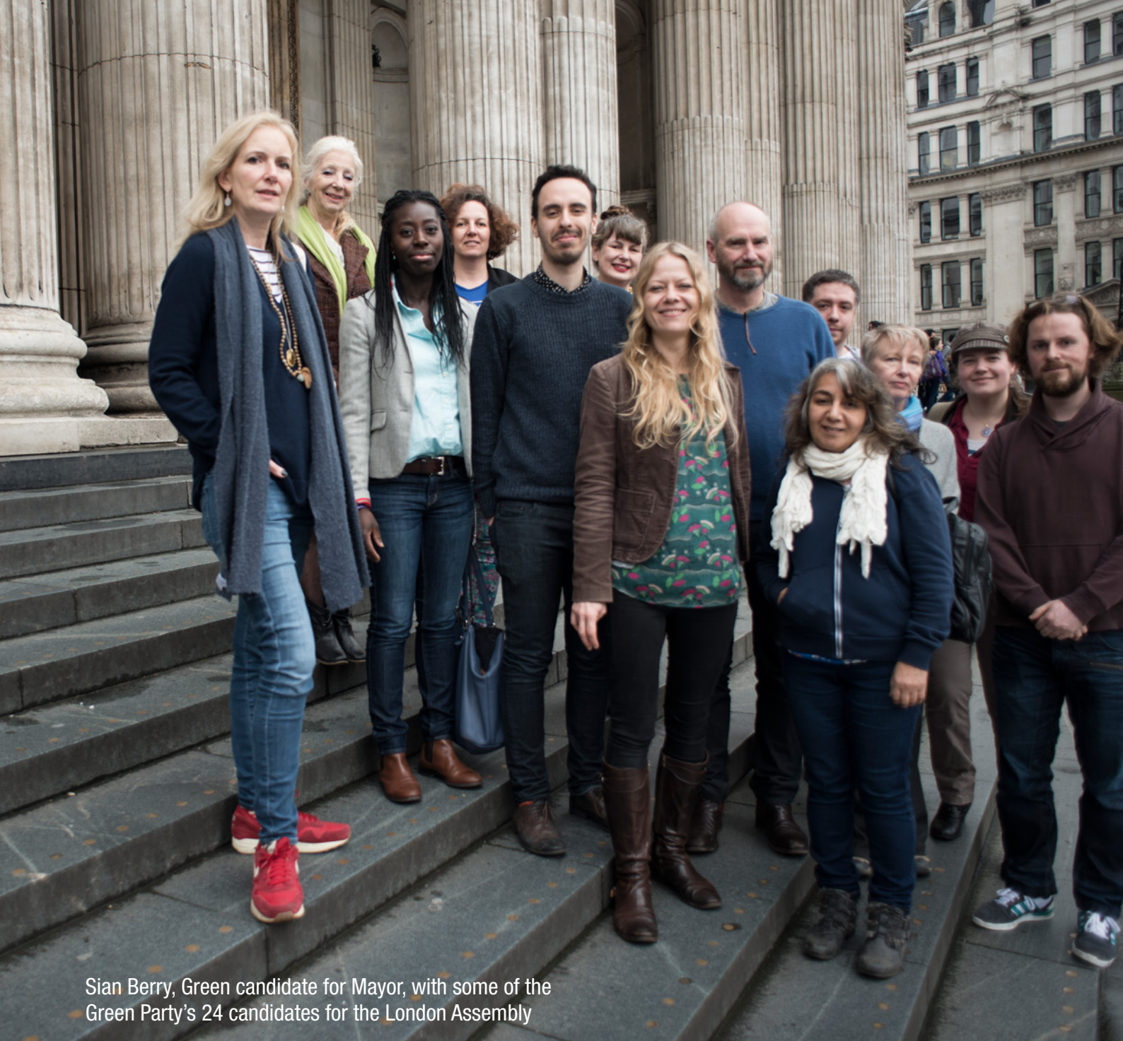
Sian Berry, Green candidate for Mayor, with some of the Green Party's 24 candidates for the London Assembly

FIND OUT MORE ABOUT YOUR GREEN CANDIDATES FOR MAYOR AND THE LONDON ASSEMBLY: WWW.SIANBERRY.LONDON LONDON.GREENPARTY.ORG.UK