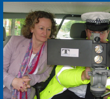
Jenny Jones AM in 2003 monitoring a police mobile safety camera initiative in Greenwich.

Green Assembly Member Jenny Jones has developed a fearsome reputation through her scrutiny of the Metropolitan Police Service.