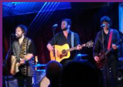
Greens will help protect music venues. Pictured: Orphan Colours performing recently at The Borderline.

The number of live music venues across London has dropped more than third in the past eight years alone.