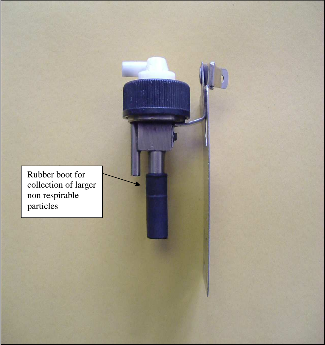
Figure 1: Cyclone Dust Head